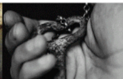
Nadette De Visser