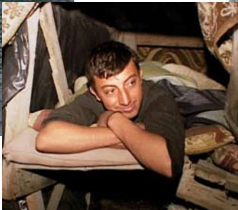
9 Star Hotel